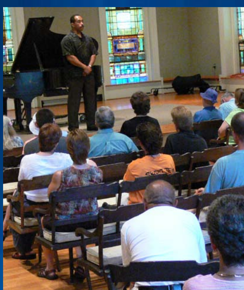
4 The Art of Celebration - The 2008 ArtsQuest Annual Report

SHARING ARTISTIC VISIONS – ArtsQuest has always supported unique artistic visions, providing platforms for artists to share their creativity with the public. In 2008, Australian performing arts troupe Strange Fruit captivated audiences as it performed its mix of theater, dance and circus techniques, all while perched atop 10-foot poles. The performances were unlike any other in the history of the festival, delighting young and old alike.