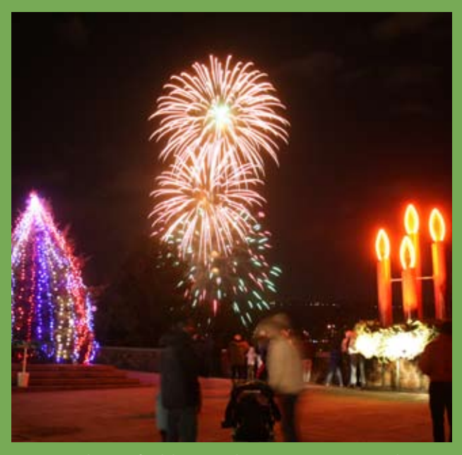
The Art of Celebration - The 2008 ArtsQuest Annual Report 9