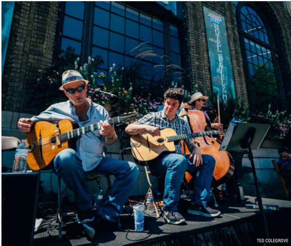
2015 was the first year for the official Hotel Bethlehem Platz at Musikfest

Musikfest 2015's many firsts included a brand new preview night Aug. 6 headlined by Duran Duran and a headlining comedy show by icon Jerry Seinfeld Aug. 10. The event also expanded its performing arts programming by adding visiting artists in residence such as Wireless Disco and Polyglot Theatre's production of "Ants," as well as new buskers to entertain the crowds. The combination of new programming and 'fest favorites turned out to be a big hit, with guests visiting the event from 42 states and 12 countries, having a major impact on tourism and the economy.