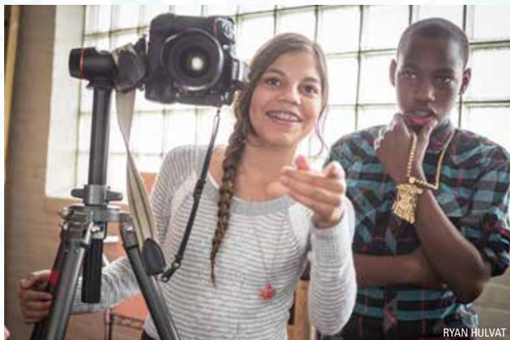
Middle school students learn photography skills in the Faces of the SouthSide program

The free Selma screenings are an example of the many ways ArtsQuest tries to provide unique arts and educational experiences for area residents throughout the year. In 2015, more than 10,000 people benefitted from the nonprofit's educational experiences through diverse programming like: