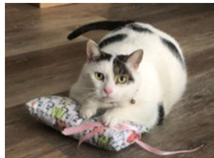
Left to right: Willow, Wasabi & Crispy, Matilda